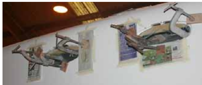
Internal and external views of Portlight installation.

takes time. It has been agreed by all that the hull should be plain, but the portlight cutout should be scribed on the hull to make it much faster and simpler, and the foam carried right through.