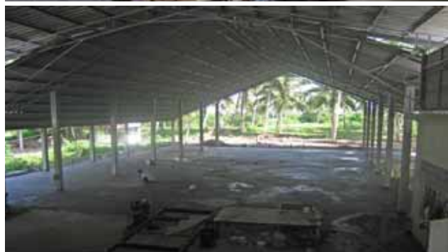
Below: The new Subic Bay, ACS Fusion assembly Building nears completion.