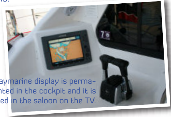
Right: The Raymarine display is permanently mounted in the cockpit and it is repeated in the saloon on the TV.