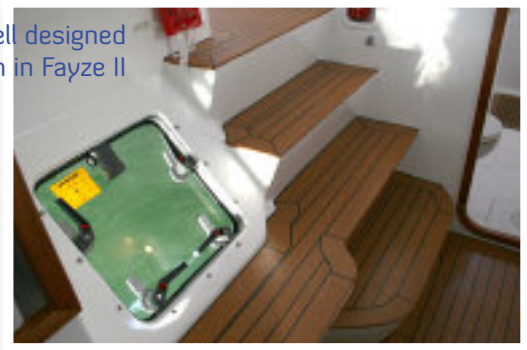
Right: Well designed escape hatch in Fayze II