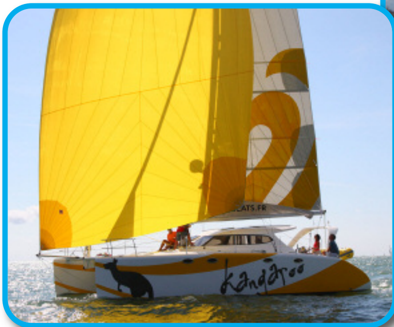
"Kangaroo" struts her stuff.

The voting has been counted and, Kangaroo has been awarded the 'No One' Graphics design for a Fusion to date.