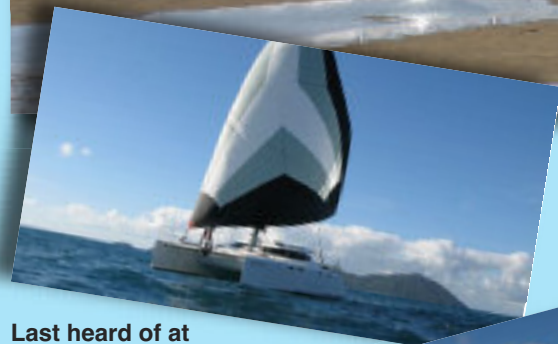
Last heard of at Lizard Island, Queensland