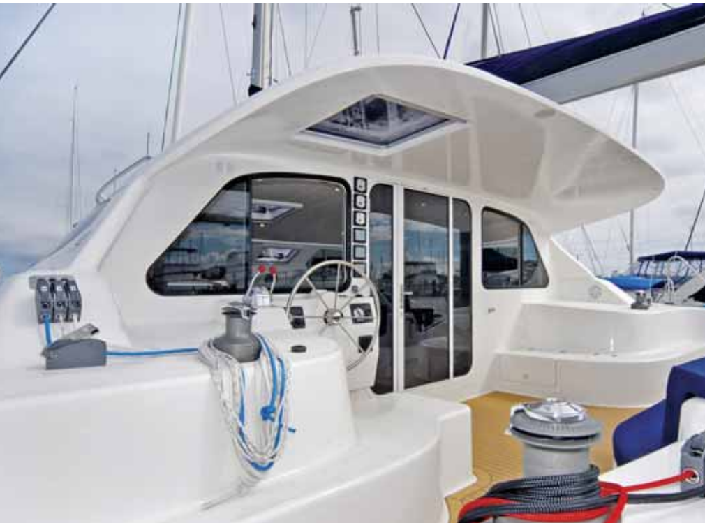
A cockpit designed for the Aussie sun. (above) Room for a crowd in the saloon. (below left) Light and airy midships. (below centre) Master cabin. (below right) Cloudy Bay ready to go. (bottom)

Fusion 40 fit the bill. And why The Cat Factory to build it? "The Cat Factory was a local business where I could enjoy the building process. I was also lucky enough to be acquainted with the quality of other boats Lloyd had built!