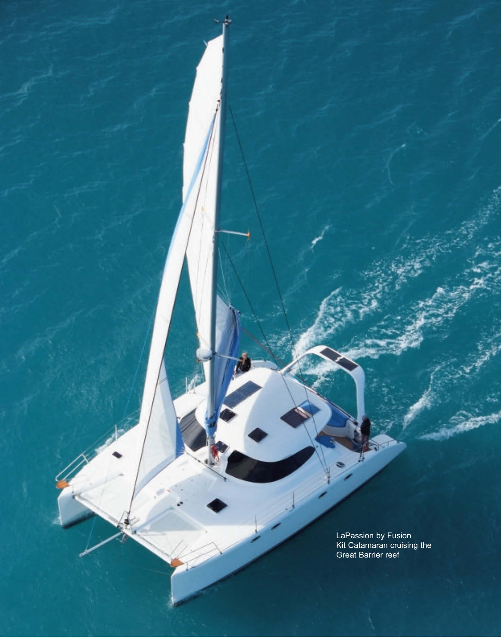
LaPassion by Fusion Kit Catamaran cruising the Great Barrier reef